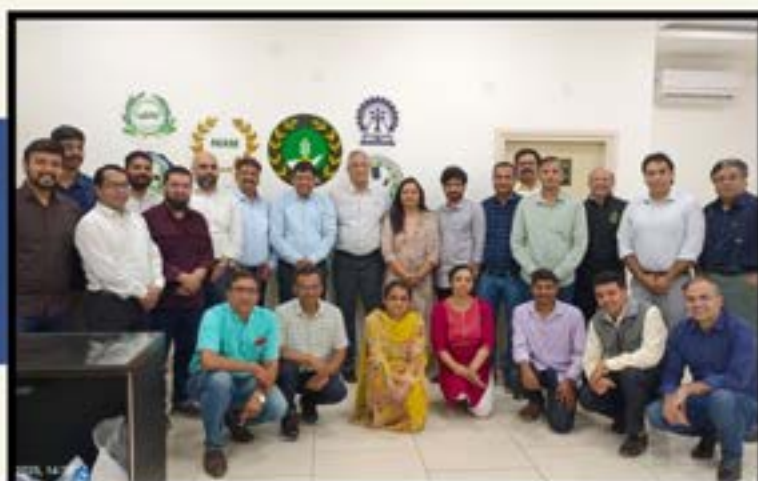
SIC MEETING OF IEF OF CCS NIAM INCUBATED STARTUPS ON MARCH 20-21, 2025