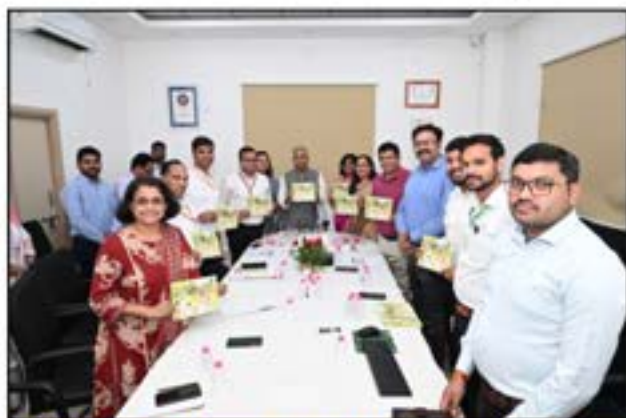
Jewels of Agri-Innovations: Success stories agri-startups nurtured under Startup Agri Business Incubation Programme II