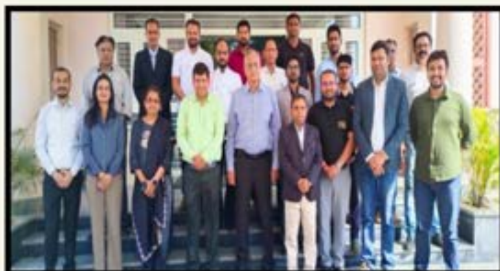
SIC MEETING OF SABAGRIS INCUBATED STARTUPS ON MARCH 18-19, 2025