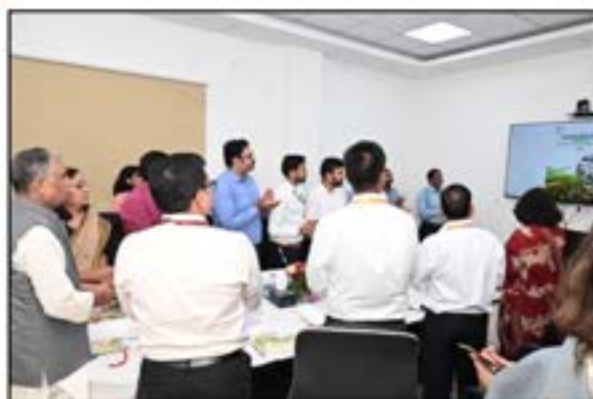
Launch of Hindi Version of Success Stories of successful agri startups incubated by IEF of CCS NIAM showcasing their novel business innovations & inspiring journeys