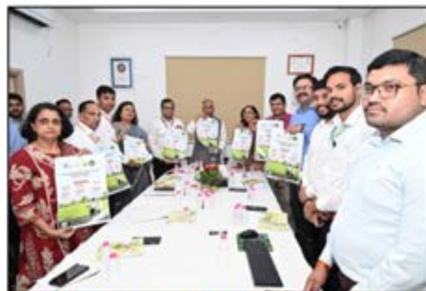
Launch of poster on Call for application under Cohort 13