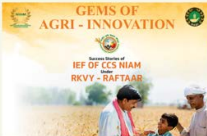
COFFEE TABLE BOOK FOR SABIP-11