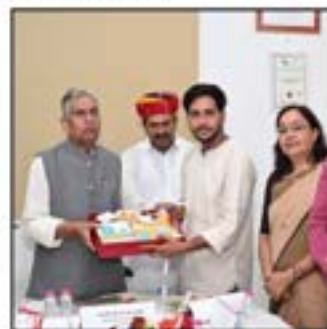
Artisanal Camel Cheese & Milk Powder