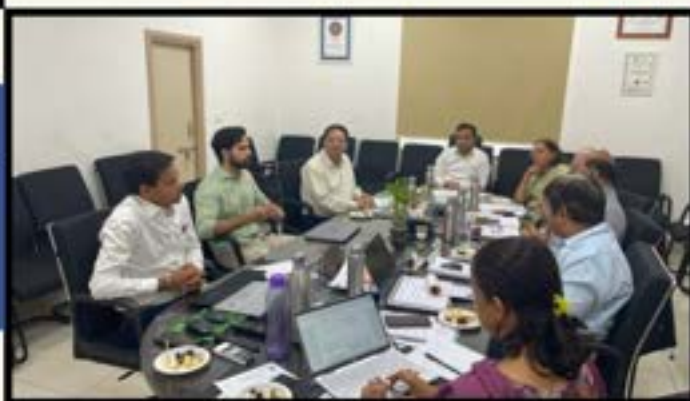
IEF OF CCS NIAM ORGANISED RIC II MEETING OF STARTUPS INCUBATED UNDER COHORT II ON MAY 2-3, 2025