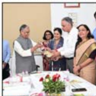
Garcinia/Kokum flavoured Olive Leaf Tea