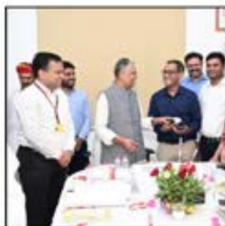
Spot Based Trading (SBT) mobile app

Hon'ble Shri Ramnath Thakur Ji, released four novel products made by our incubated startups namely, "Spot Based Trading (SBT) mobile app" – a step toward smart agri-logistics and digital commodity trading developed by M/s. Singodwala Warehouse and Logistics Private Limited, "Garcinia/Kokum flavoured Olive Leaf Tea" developed by M/s. Olitia Foods Private Limited; "Coin Khakhraa - a nutritious, low GI snack made using whole Bengal gram flour, rich in protein, fibre, and essential minerals" by M/s. Sukit Foods Private Limited & "Artisanal Camel Cheese & Milk Powder" showcasing commitment to sustainable and inclusive dairy innovation developed by M/s. Bahula Foods Private Limited.