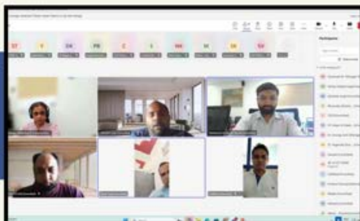
ONLINE OUTREACH SESSION FOR COHORT 12 CALL FOR APPLICATION TITLED 'KICKSTART YOUR AGRISTARTUP' ORGANIZED BY IEF OF CCS NIAM AND AGRI INNOVATION HUB (AGHUB), PROFESSOR JAYASHANKAR TELANGANA STATE AGRICULTURAL UNIVERSITY (PJTSAU) ON MARCH 25, 2025