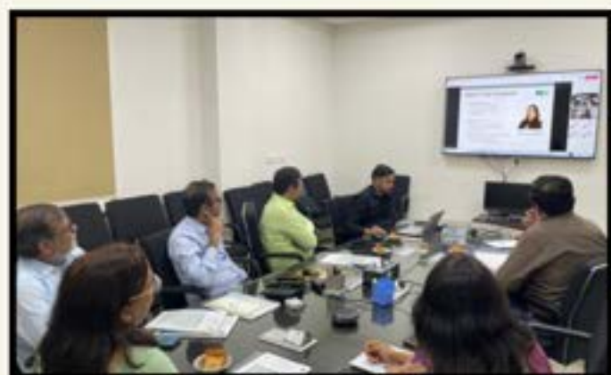
ONLINE WORKSHOP UNDER THE GLOBAL THEME "BEAT PLASTIC POLLUTION" IN ASSOCIATION WITH CSIR-CIPET, JAIPUR CENTRE ON 5 TH JUNE 2025