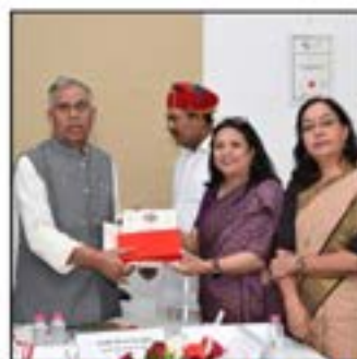
Coin Khakhra - a low GI snack made using whole Bengal gram flour